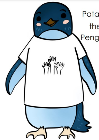
Patariki the Penguin