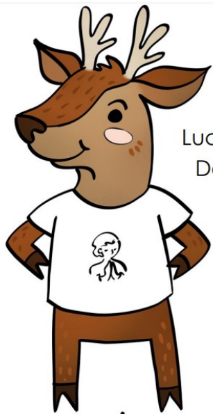
Luc the Deer