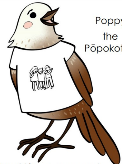
Poppy the Pōpokotea