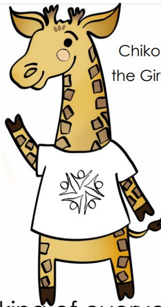
Chikondi the Giraffe