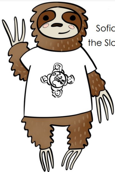
Sofia the Sloth