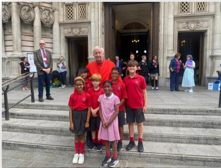
Our students from Years 4 and 5 with Cardinal Nichols at the end of the service.

https://flickr.com/photos/27500466@N05/albums/72177720327074366/