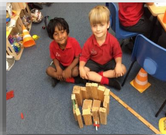
Building a new church!