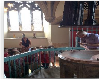
The Baptismal Font