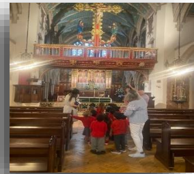
The Holy Rood