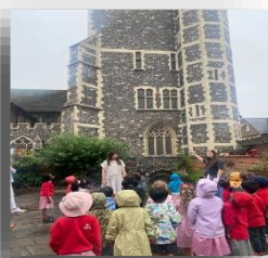
Outside the church