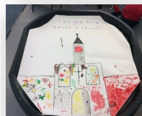
Painting a new church!